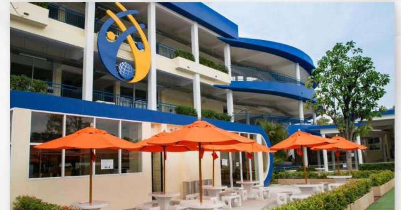
Chaofah City Campus